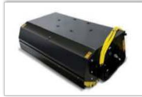
5 SWEEPER COLLECTOR