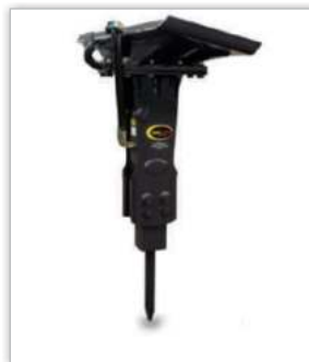
11 ROCK BREAKER