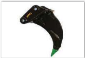
7 RIPER TOOTH