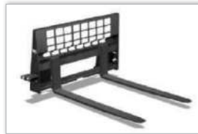
8 PALLET FORK