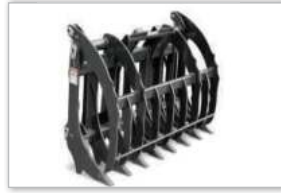
2 INDUSTRIAL GRAPPLE