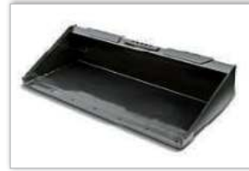
6 DITCH CLEAN BUCKET