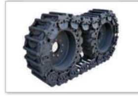
3 CHAIN/RUBBER TRACKS