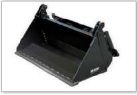
1 6 IN 1 BUCKET