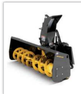
12 SNOW BLOWER